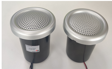
2 x 15W 12V Bluetooth Speakers